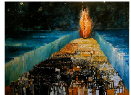
JEWISH COALITION TO END HUMAN TRAFFICKING

Register at https://jceht10anniversary.eventbrite.com